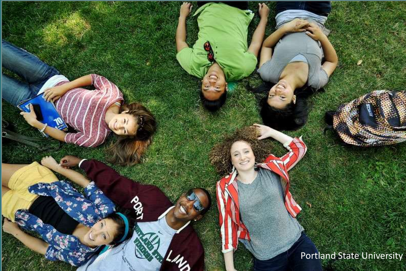
Portland State University