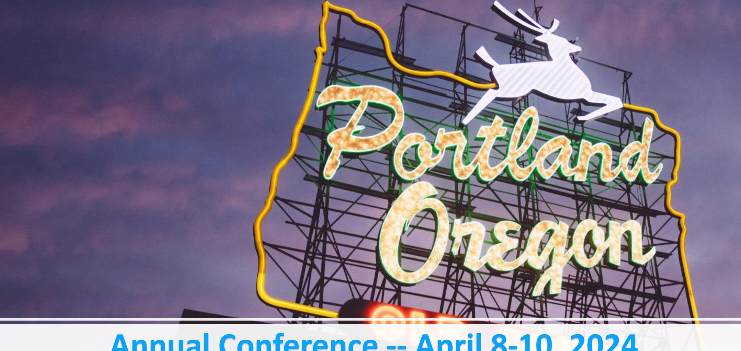
Annual Conference -- April 8-10, 2024